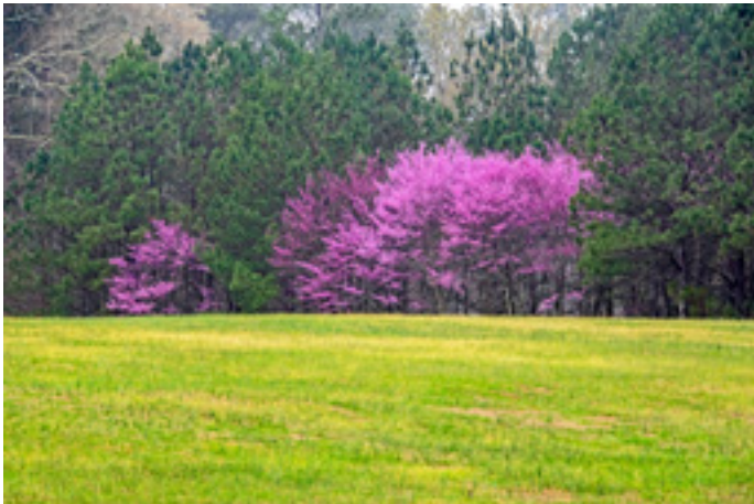
Field next to Pigeon Hill parking lot - 3/1/23.