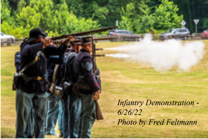
Infantry Demonstration - 6/26/22