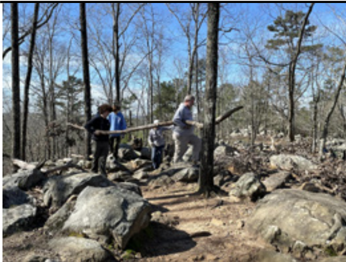
3/11/23 Work Day