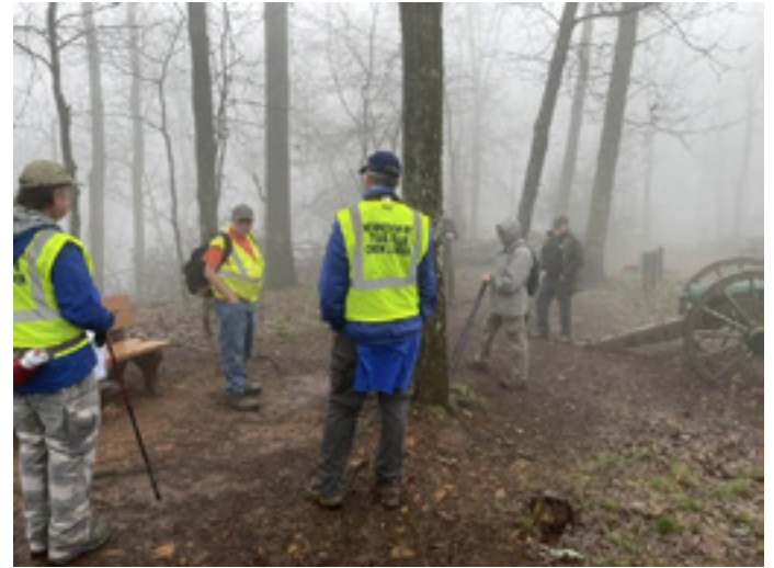
Left - Cannon position on top of Kennesaw Mtn. Above - Work Day prep on 3/10/23