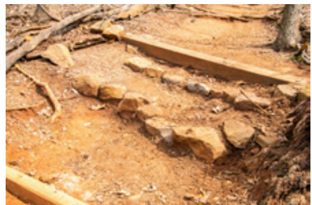
Step Improvement - 3/11/23