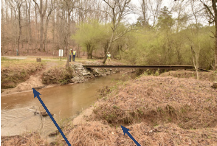
Closed Horse crossing points.