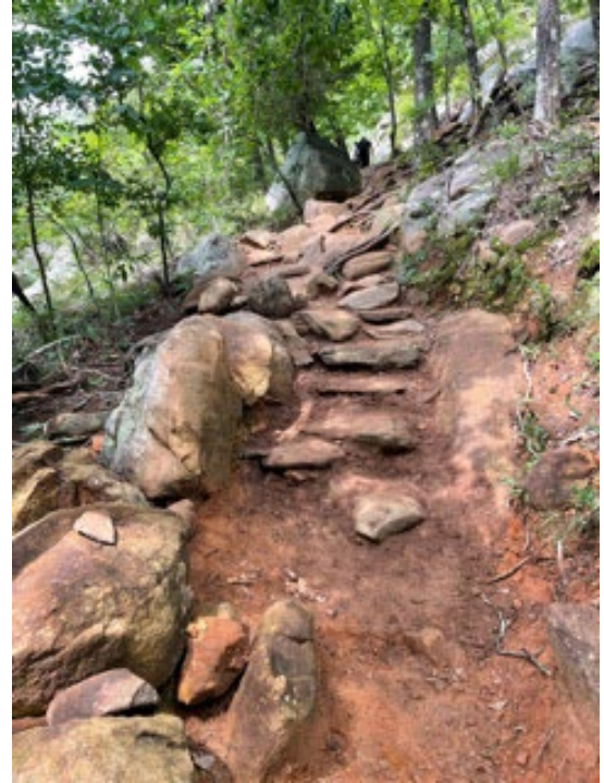
Additional photos of the second project worked on 7/10/21