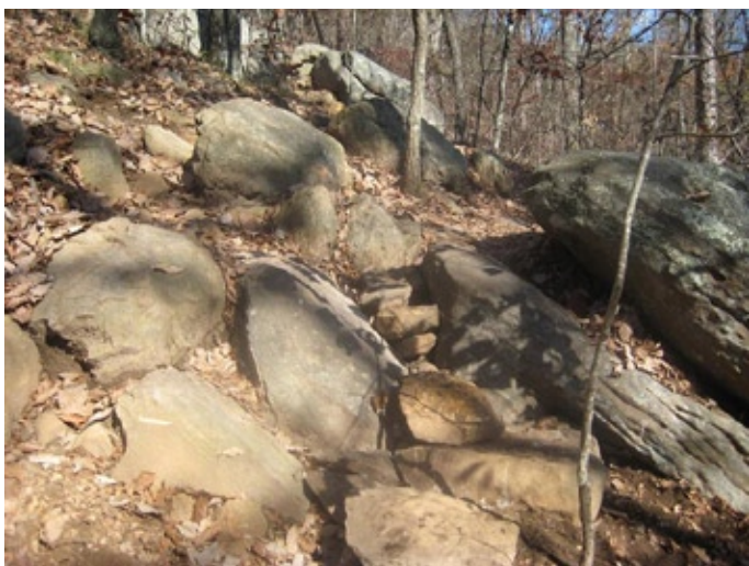
Problems fixed on November 14th on the backside of Little Kennesaw Mountain.