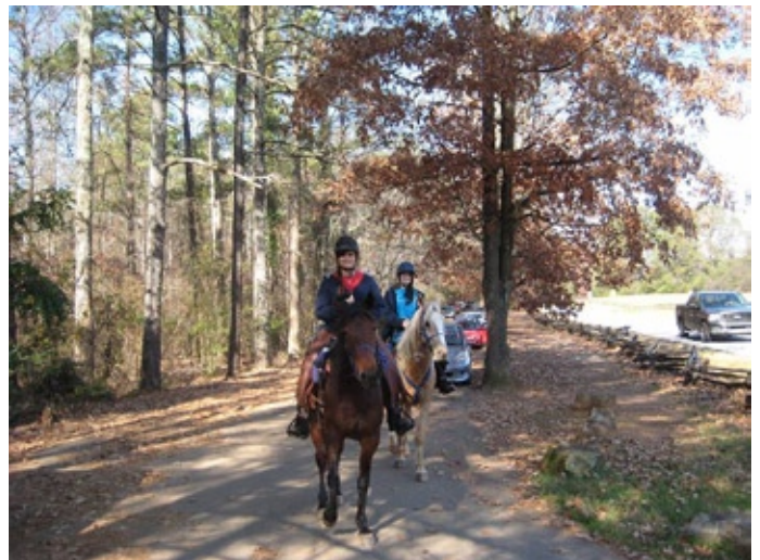
Some Park Visitors Enjoying a Day at the Park.

November 21st Workday was spent rectifying a drainage problem near the Cheatham Hill Parking Area.