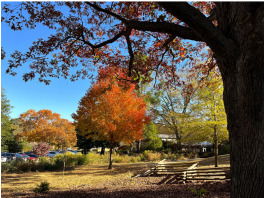
Just another autumn day at Kennesaw Mountain!