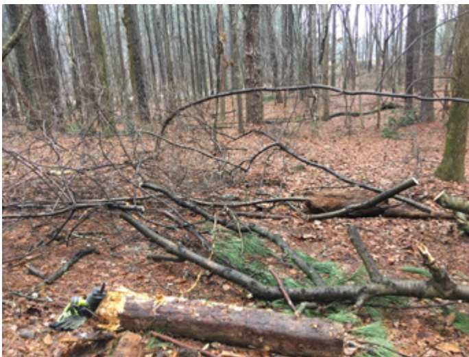
Above - "Before." This is the result of the December snow.