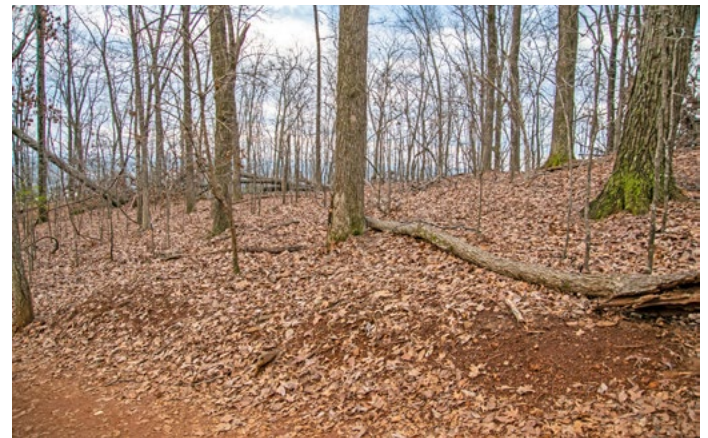
Photos of the peach orchard terraces on Kennesaw Mountain. Pictured above is a photo taken 1/13/21 of a couple of the terraces on Kennesaw Mountain. The photo, below, is an enhanced version to better portray the terraces.