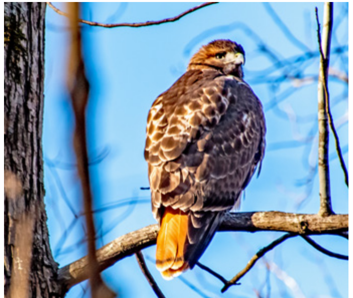
A Park resident was watching the progress of our work day on 1/28/23.