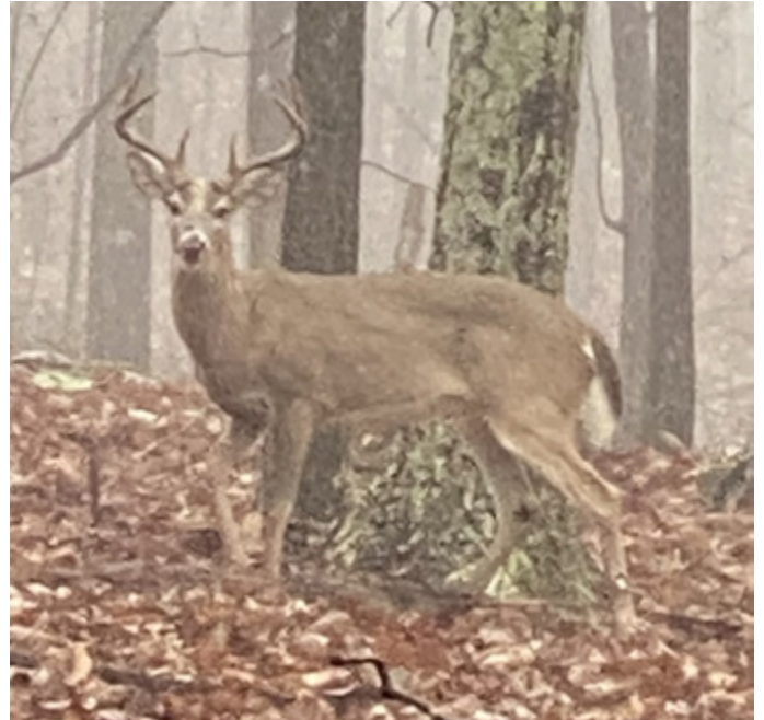
near the Brumby Trail mid