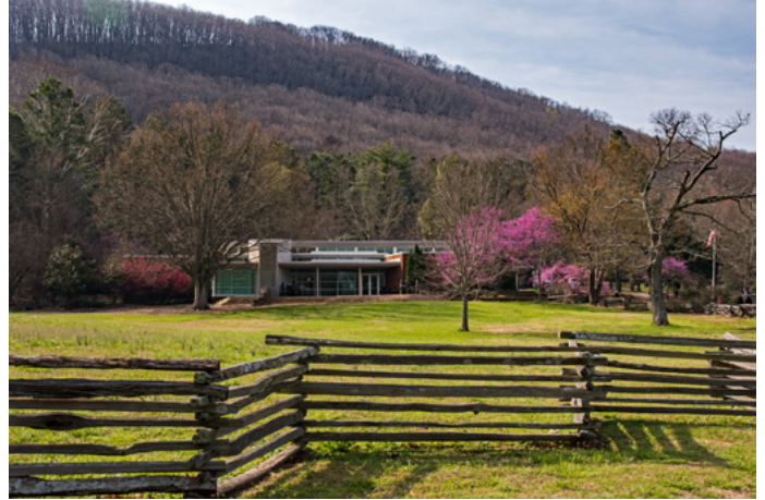
Spring At Kennesaw Mountain

The December Work Day was cancelled because of weather.