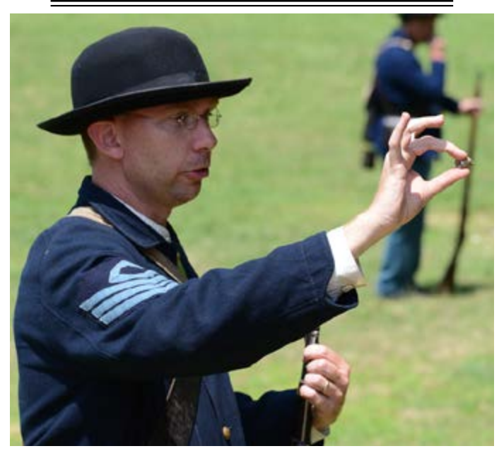
149th Anniversary