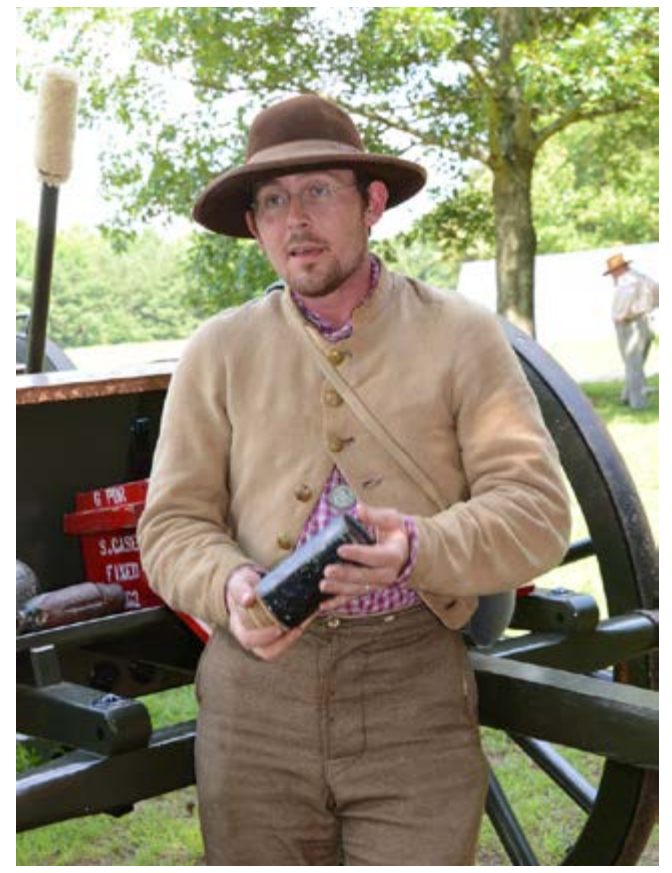
149th Anniversary - Artillery Demonstration.