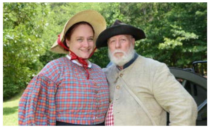
149th Anniversary