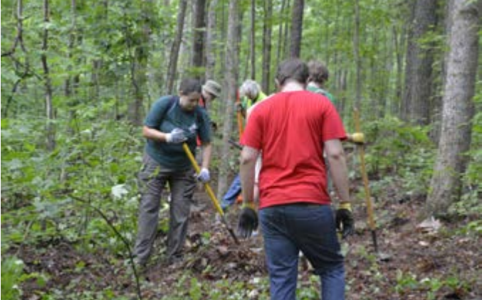
Newsletter 9 http://kennesawmountaintrailclub.org