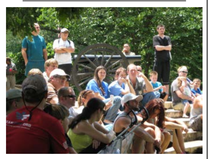
Visitors watching Infantry and Artillery demonstrations - photo by Ann Page. 149th Anniversary