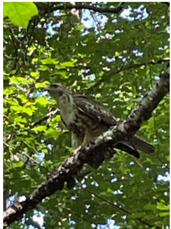
near Cheatham Hill Road parking lot.