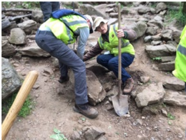
The Great KMNBP Step Artiste at Work.