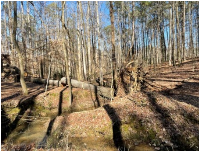
Root ball of the same tree, above, right.