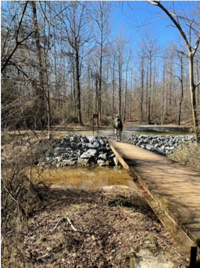
The Ward Creek bridge although damaged is still being used. Noticed additional rip rap from our last visit.