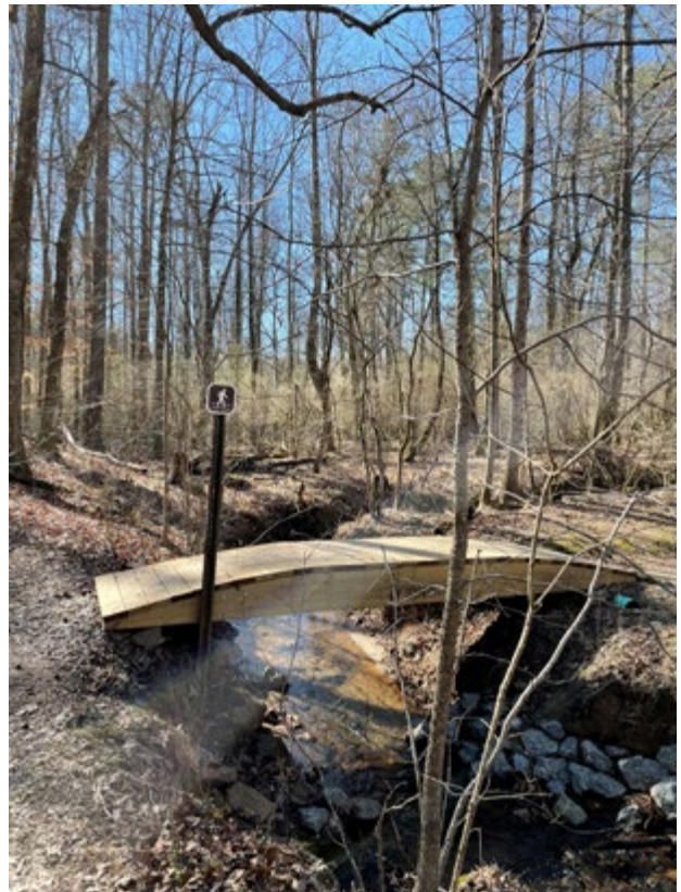
New small bridge had been installed.

Jay Haney and Anne Page Mosby conducted this foot patrol on 2/17/21 from Bailey Farm to East bridge Kolb Farm Trail.