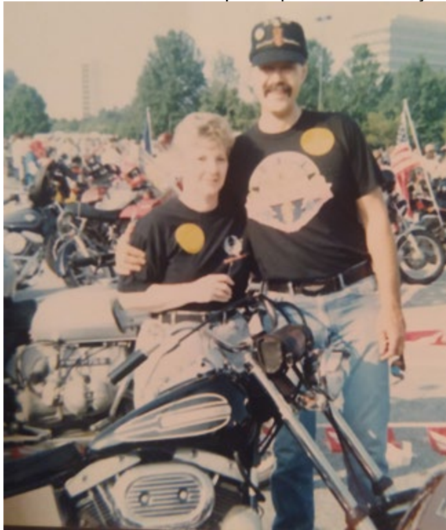
An "un-named" biker couple

Yes, it is daring to something that others may not - that's their problem and not yours.