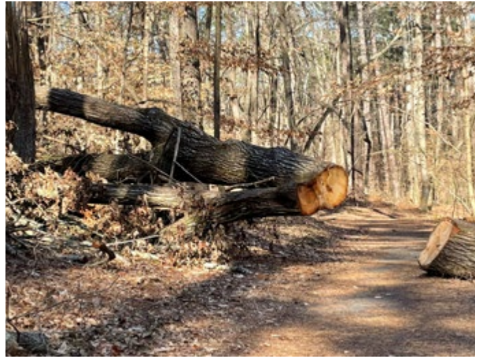
A massive oak had been cleared to open the trail.

Jay Haney and Anne Page Mosby conducted this foot patrol on 2/17/21 from Bailey Farm to East bridge Kolb Farm Trail.