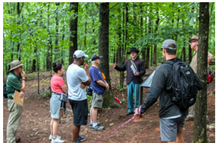
Photo from 153rd Anniversary.