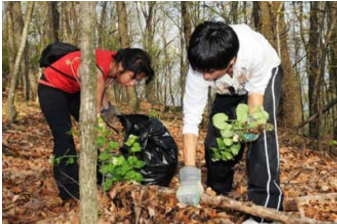
Picking up Garlic Mustard

Costco – energy bars for volunteers and a $25 gift certificate for Club expenses for the National Trails Day Event.