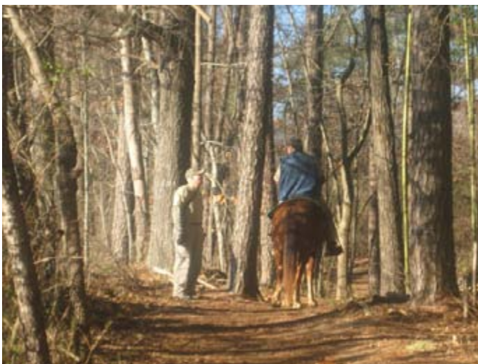
Trail Ambassadors at work