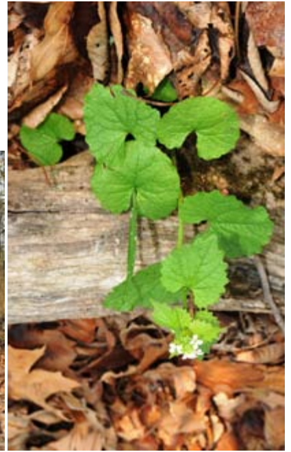
Garlic Mustard!