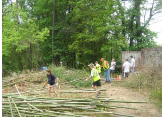
Bamboo Eradication Efforts