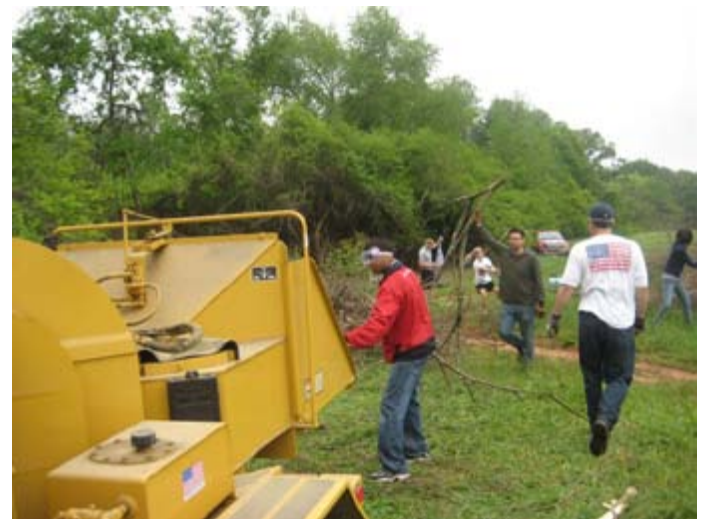
Earth Day