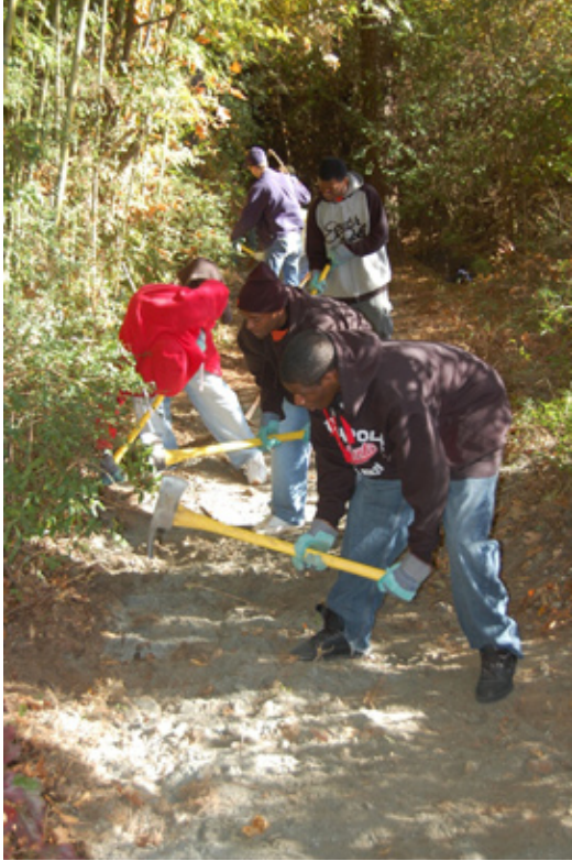
November Trail Work Day Pictures