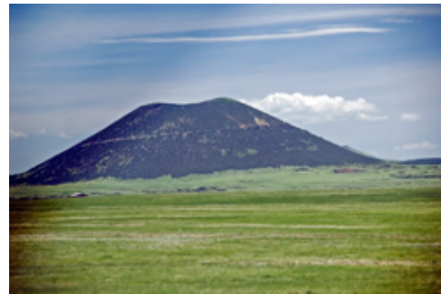
Capulin Volcano National Park - Capulin Volcano is located in Northeastern New Mexico - about 75 northeast of Philmont Scout Reservation.

View from atop Capulin Volcano National Park - approximately 8,000ft above sea level.