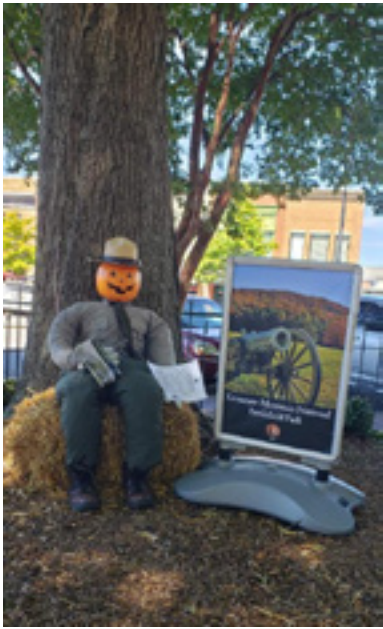
On The Marietta Square