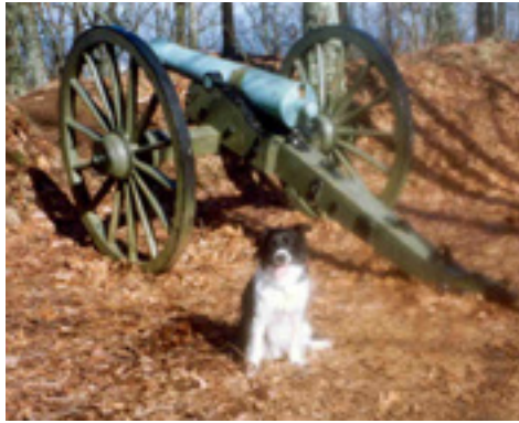
Above - Way before!