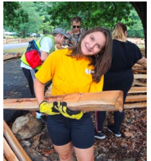
on left the "Rebar Removal" Crew; On right - the finishing touches on the new fence.