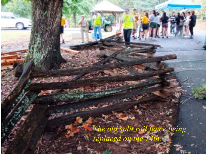
The old split rail fence being replaced on the 14th.