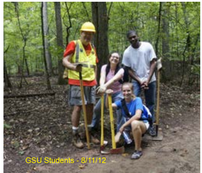
GSU Students - 8/11/12

Look forward to a good turnout; weather should be great for a September day!