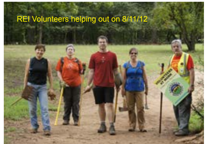
REI Volunteers helping out on 8/11/12