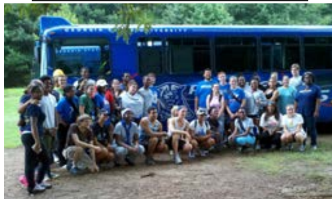
56 Students from GSU spend the day at Kennesaw Mountain National Battlefield Park