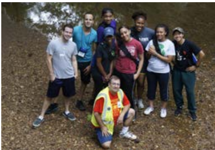
GSU Students

"Earthworks" is published monthly by the Kennesaw Mountain Trails Corps.