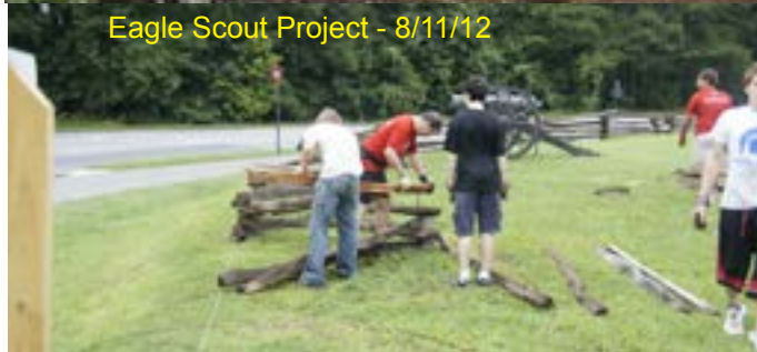
Eagle Scout Project - 8/11/12