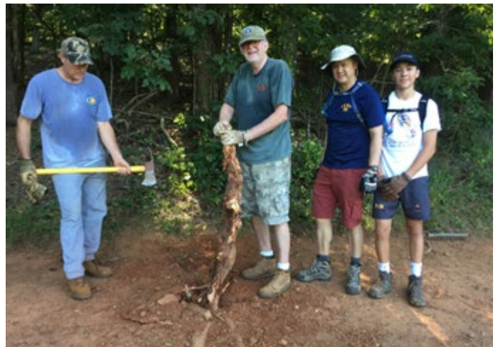
Root begone! during the August work day.

Below: Clean-up project undertaken by Curt Spinney after a small tree fell partially on the trail to Pigeon Hill.