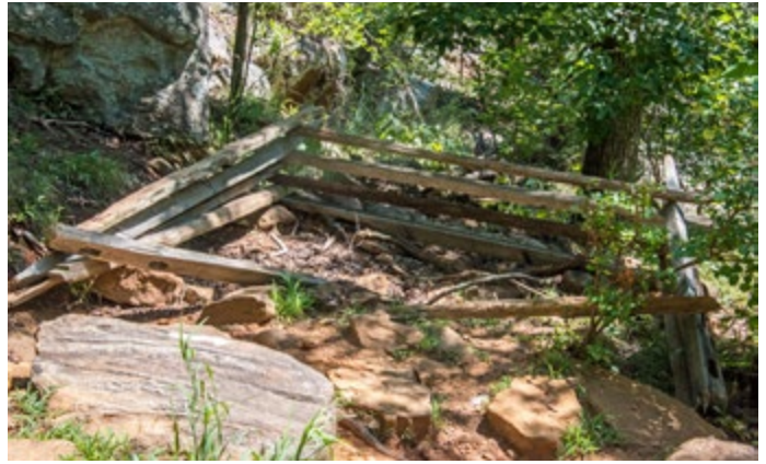
Completed SCA project - closing a social trail on the backside of Little Kennesaw.