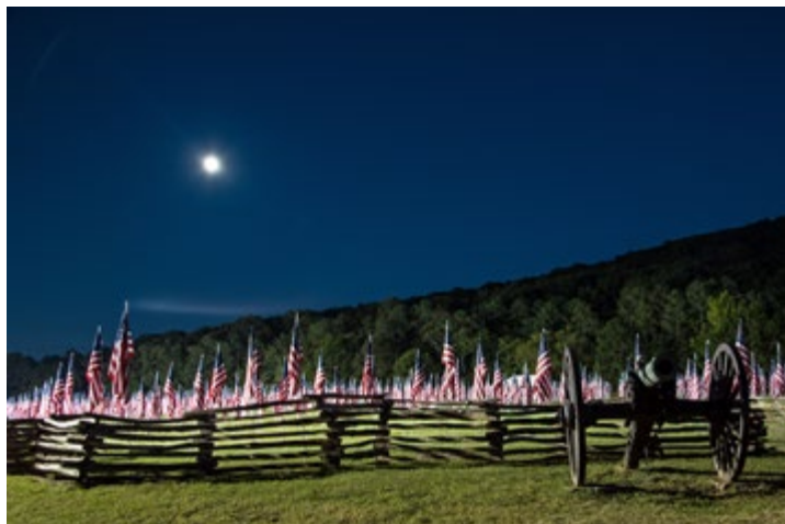
Field of Flags - September, 2016

Organized by the Kiwanis Club of Marietta through the Marietta Kiwanis Foundation, the 9/11 Field of Flags is displayed every five years and has become one of the largest commemorative events in the nation. Flag sponsorship helps to fund this project and ensure its continuation in the future. The Marietta Kiwanis Foundation is a 501(c)(3) organization, #58-1409116.