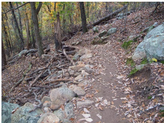
Above and below: Section 216, After