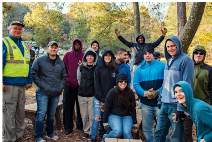
One of the November work crews.