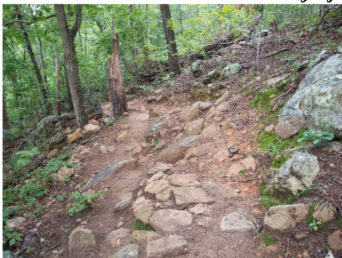
Section 216, Before